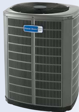
AccuComfort™ Platinum 20

American Standard Platinum air conditioners offer our highest combination of performance, efficiency, and temperature control. Built with American Standard's commitment to quality throughout, the Platinum line offers advanced energy-saving features like Duration™ variable speed compressors and Spine Fin™ coils.