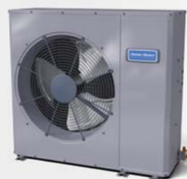
Silver 16 Low Profile