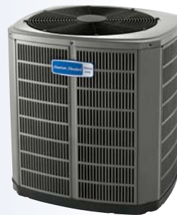
AccuComfort™ Platinum 18